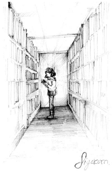
Figure 4: Example of student drawing