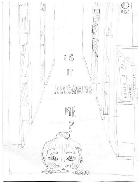
Figure 2: Example of student drawing