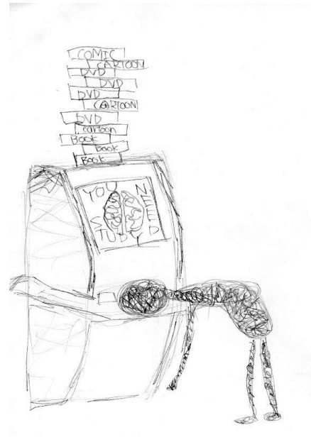
Figure 3: Example of student drawing