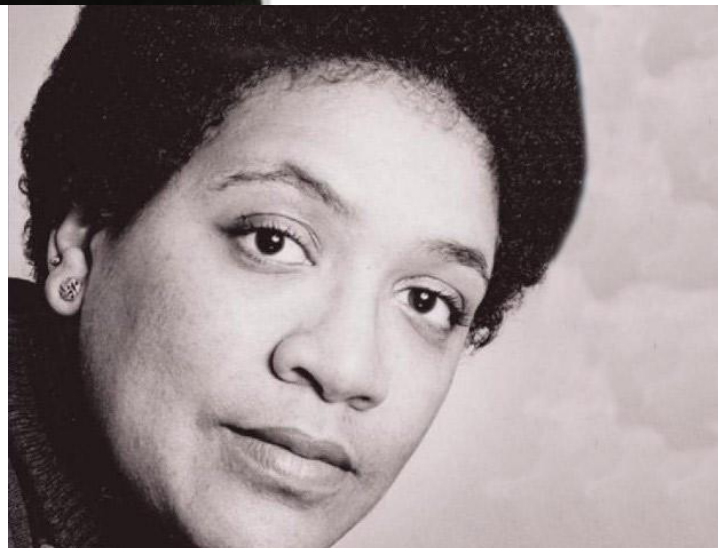
ADRIENNE RICH AND AUDRE LORDE