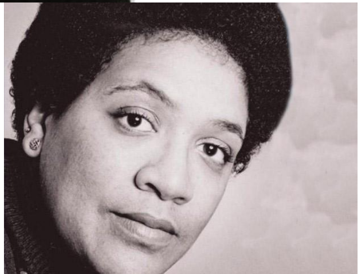
ADRIENNE RICH AND AUDRE LORDE