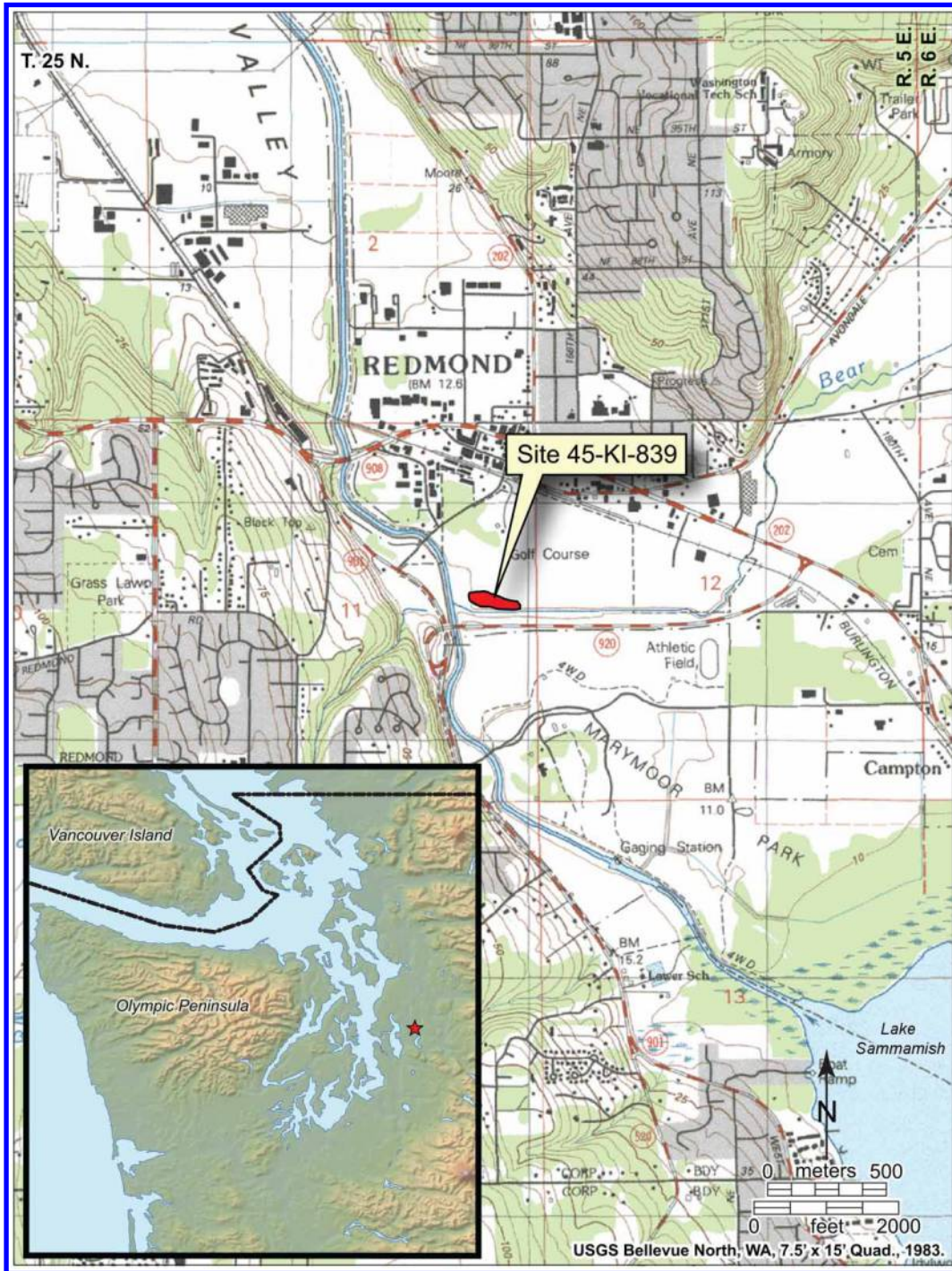
Figure 1 Location of the Bear Creek site (45KI839) near the north shore of Lake Sammamish, Puget Lowland, Washington.

or shorter-term environmental changes, particularly in Stratum V, which includes the in situ artifact-bearing Stratum Vc. The current radiocarbon sequence is based on 12 samples taken during the 2008 and 2009 investigations (Table 1). Most of these samples are within Stratum Vb, providing upper limiting dates on the in situ assemblage. One fragment of detrital charcoal obtained from Stratum Vc sediments, the in situ artifact-bearing deposit, yielded a date of 10,780 \pm 60 ^{14}\text{C} yr BP. Additional dating of this stratum is underway and will hopefully shed light on local site formation processes as well as the