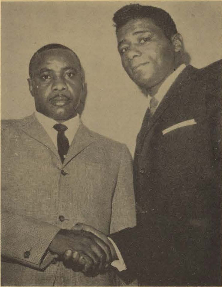
Floyd Patterson, heavyweight champion of the world, right, shakes hands for the first time with the leading contender for his title, Sonny Liston. Note the size of Liston's much publicized fist. The grimness with which they greeted each other could foretell the type of fight a meeting between these two ring stalwarts might produce.