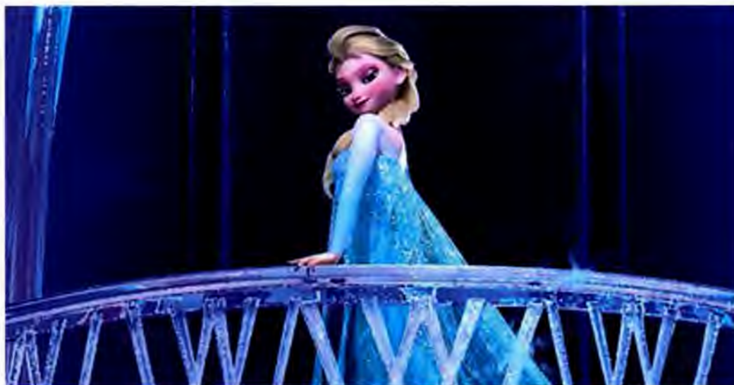
"Frozen" 2013 / Disney

Equitable representation in the media has been a topic of conversation (and contention) for quite some time. The plethora of thinkpieces on whitewashing and erasure, along with critiques of inaccurate depictions of historically marginalized groups in the media make it evident that many consumers of popular media view representation as an important issue.