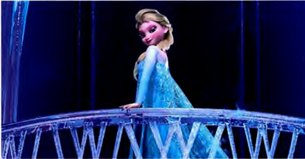
"Frozen" 2013 / Disney

Equitable representation in the media has been a topic of conversation (and contention) for quite some time. The plethora of thinkpieces on whitewashing and erasure, along with critiques of inaccurate depictions of historically marginalized groups in the media make it evident that many consumers of popular media view representation as an important issue.