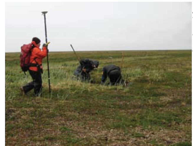
Figure 3. Recording feature with GPS unit.

tures are smaller house or storage features that are not as densely clustered as the large settlements that were the focus of previous investigations. Although new features were recorded in survey areas across the beach ridge complex, many of these features date to the last 1,000 years.