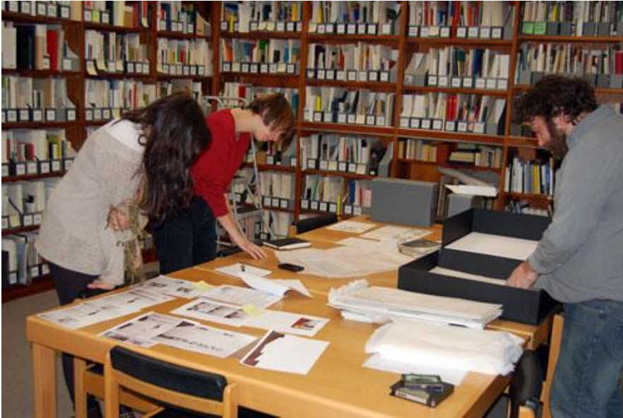
Figure 7: Chelsea College of Arts students and staff participating in special collections session