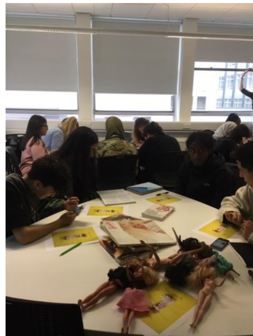
Figure 6: Students in ‘Unpack Barbie’ session