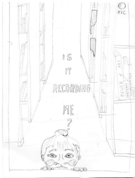
Figure 2: Example of student drawing