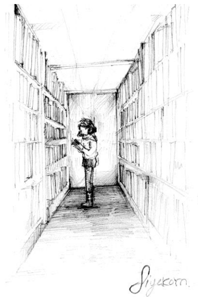
Figure 4: Example of student drawing