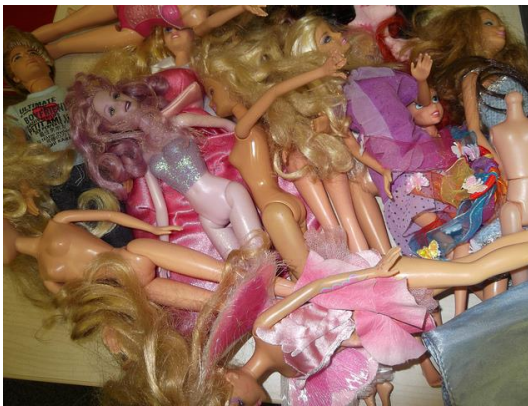
Figure 5: Examples of objects in ‘Unpack Barbie’ session

opportunity and a safe learning environment in which students can develop the critical thinking, questioning and visual literacy skills which are the intended outcomes of the session. This example of object-based learning in practice is a good example of ‘reflection in practice,’ as identified by Schön (1983) where students reflect, evaluate and take action through making decisions during the object handling activity. ‘Unpacking Barbie’ has been successful for the LCF Library and Academic Support teams and is now in its third year. Feedback suggests that, as a result of taking part in the workshop, students feel that they have acquired new research skills and talk fondly of the experience and how they have used the library and will continue to do so throughout their studies.