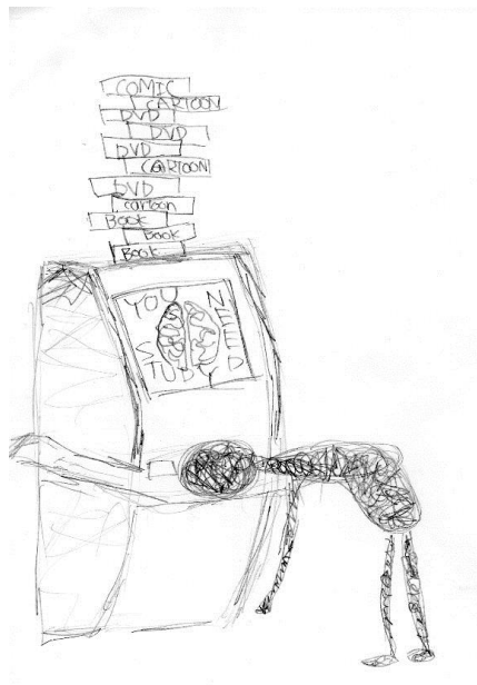
Figure 3: Example of student drawing