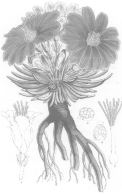
Among the limited visual documents surviving from the expedition itself are drawings of flora and fauna, including Lewis's illustration (above) of bitterroot, Lewisia rediviva .

(From Duncan and Burns, Lewis and Clark: The Journey of the Corps of Discovery [New York, 1997], 39)