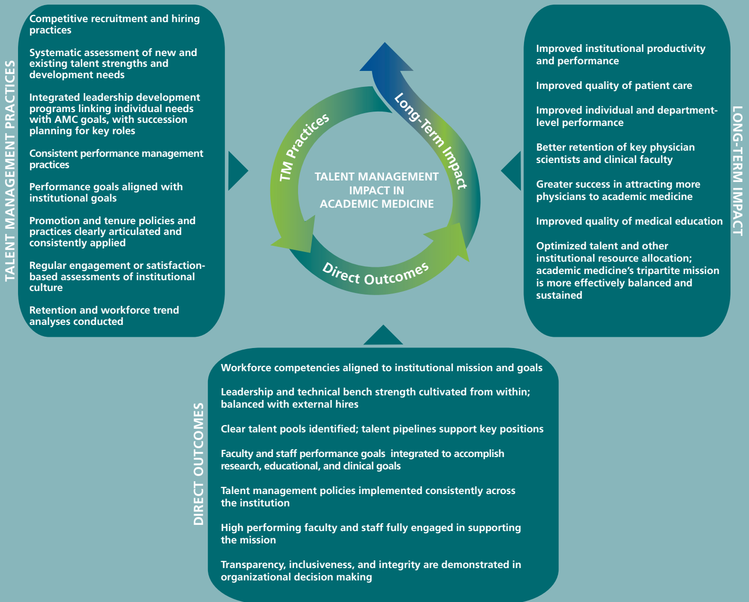
Logic model describing the impact of talent management in academic medical centers (illustrative).