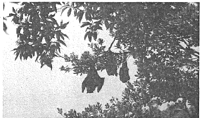
Livingstone's fruit bats roost predominantly on south- and east-facing slopes, suggesting that bats are sensitive to wind and sun.

with their big, rounded ears. Like other Pteropus , Livingstone's fruit bats are tree-roosting frugivores that depend on a diet of fruit, pollen and leaves. They are found roosting during the day in groups of 6 to 160 individuals in 1 to 8 roost trees per site. Livingstone's Fruit bat is believed to be a "sequential specialist," feeding at any one time on one or a few plant species among a group of potential food plants available at that time/season (Marshall 1983). Such a diet may cause roost sites to vary, depending on the season and food availability. There is very little known about their diet, behavior, and reproductive patterns, though there is some indication that females with young move to maternity roosts while their babies are still in their first few months of life.