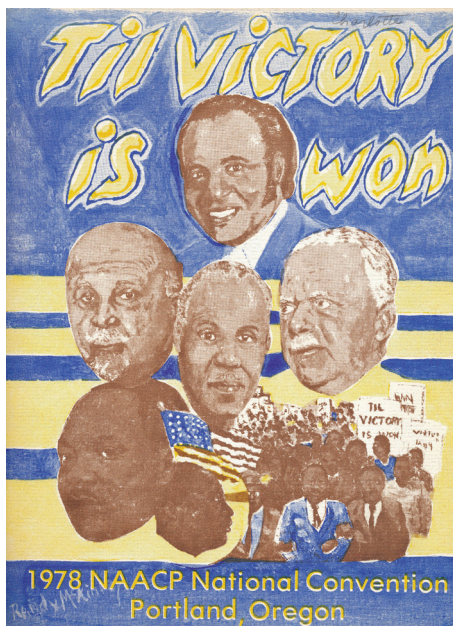
Cover, 1978 NAACP National Convention program, Portland, Oregon.

Over the past ten years, Special Collections has focused on building a significant collection of primary materials documenting the history and development of 20th century Oregon, with an emphasis on community action and civic leadership. The Rutherford Family Collection is a welcome and important addition to a number of other collections that support research and engagement with our state’s diverse history, including the Gates Collection of African American History and Culture; the political papers of the Hon. Avel Gordly, the first African American woman to be elected to the Oregon State Senate; and the records of the Portland Chapter of the Japanese American Citizens League, the local branch of the national organization dedicated to advocacy for Asian American civil rights. As stewards of these invaluable resources, Special Collections is dedicated to their security and preservation so that they may remain available for generations to come. We hope that our commitment to the Rutherford Family Collection will continue to encourage others in our community to both utilize these important resources and to consider sharing their unique historical materials in partnership with the University Library.