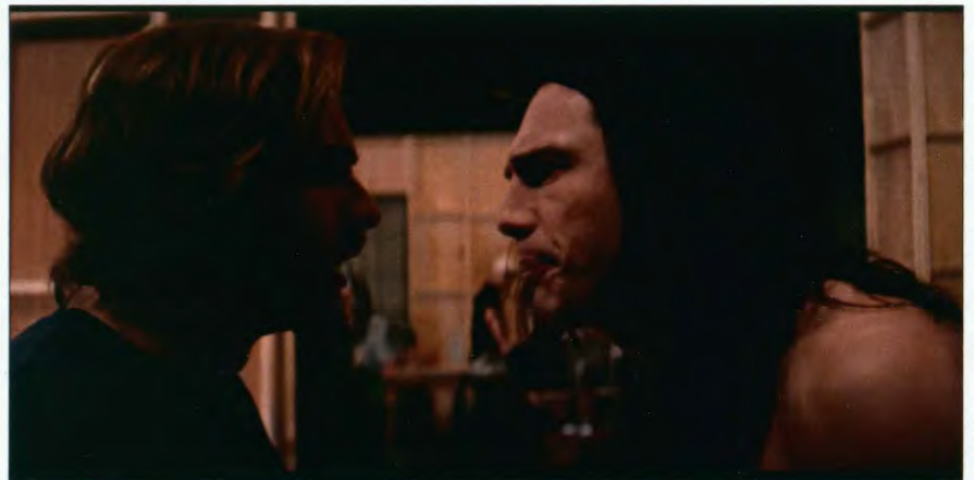
still from “The Disaster Artist” movie trailer

At the end of “The Disaster Artist,” as Wiseau steps up onstage to take the first of many bows for a thoroughly entertaining piece of work, it is not a celebration of the movie he made, but a celebration of coming back together with Sestero and making amends that the audience can most identify with. In a certain way, Sestero and Wiseau are painted as soul mates and kindred spirits—they may separate or fall out at times, but they will find their way back to each other regardless of what it is that drove them apart, and it is through this bond that “The Room” was even made possible to begin with, for better or for worse.