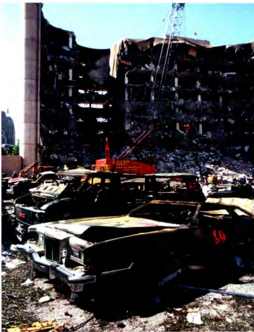
photo of the aftermath of the Oklahoma City Bombing