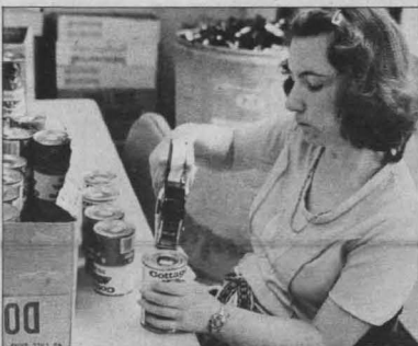
Joy practices labeling cans