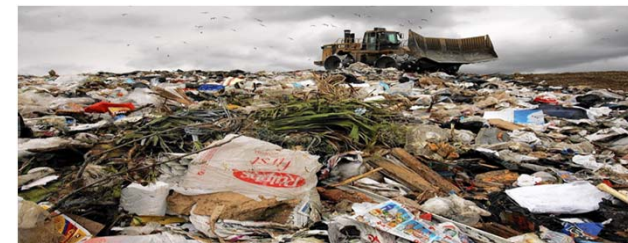
Figure 3: Trash In Landfill

By starting this program at a young age, students will be inclined to not litter in their adulthood. Fines will also be issued for littering to fund these sessions as well as enforcement of this law.