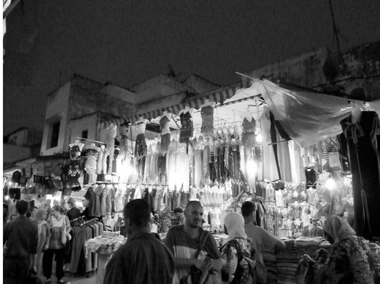
Belly dance costumes for sale in the Rabat souq , Morocco, October 2009