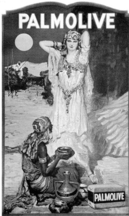
Postcard purchased in Rabat, Morocco, October 2009 [Figure 2.1]

A phenomenon referred to as Salomania, 15 connoting the widespread, fervent interest in Salome-inspired Orientalist imagery, was usurped by a generation of young American women experimenting with gender identity and social norms. For many American women, this experimentation included donning the persona of Salome and dancing on stage and in private homes. With Salomania, a dance movement was born, a process by which American women could explore their creativity, gain a sense of community, and express their inner most desires. Several pioneering American dancers and