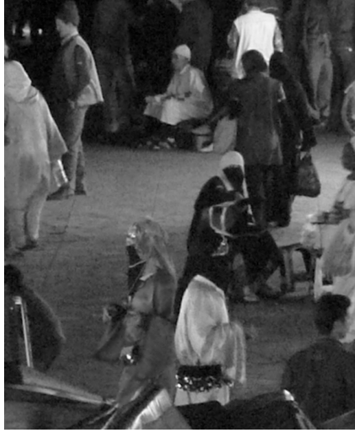
Male belly dancers Marrakech, Morocco, November 2009