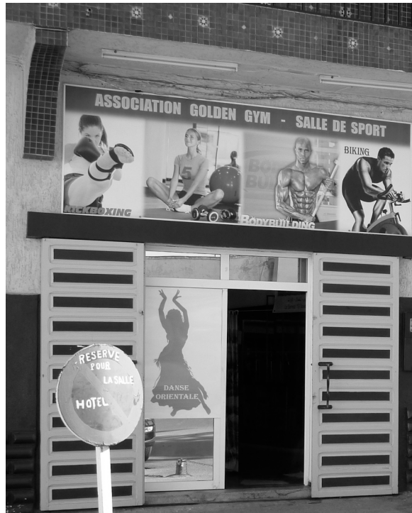
Oriental dance classes, Rabat Medina, Morocco, October 2009

told me she used to teach belly dance classes in Morocco and mostly tourists attended her classes and performances.