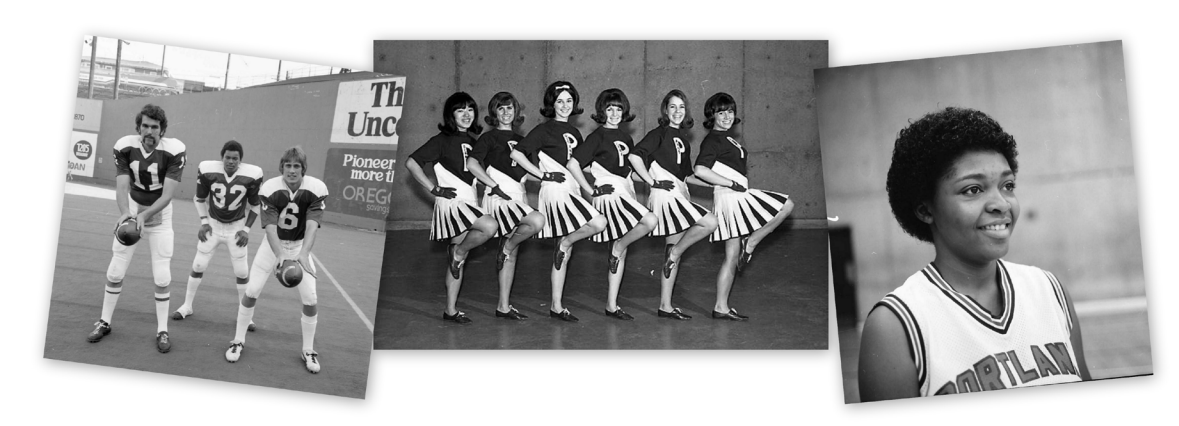
Find these photos and more in the Digital Gallery at https://archives.pdx.edu/digitalgallery/

The University Archives Digital Gallery now includes 3,200 athletic photos from 1953 through 1991. The collection includes dynamic action shots as well as team and individual portraits from a range of sports, including football, basketball, gymnastics, bowling, fencing, and more. Who are all these athletes? In many cases, we don't know! We would love your help in identifying the names of people in these photographs. Look for the "Tell Us!" option under each photo.