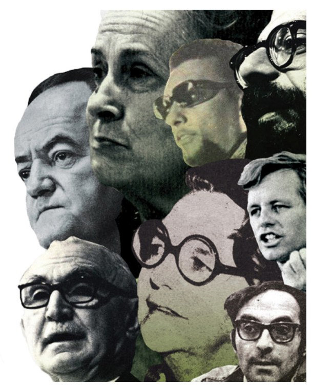
Listen to the Oregon Public Speakers Collection at http://pdxscholar.library.pdx.edu/orspeakers/

Between 1958 and 1979, Portland State University hosted over hundred speeches, interviews, panel discussions, and readings by scholars, activists, politicians, authors, artists, and community members. Many of these events featured prominent public figures who were invited to campus by academic departments, university administration, or interested students. Portland State was a campaign stop for Presidential and Congressional candidates in the late sixties and early seventies, a focus of urban development in Portland, and fertile ground for conversations on politics, social justice, science and technology, the arts, and the future. The recordings in this collection reveal an era of vital dialogue and debate supported by the university and its community.