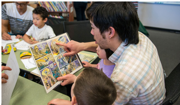
We had a wide range of books available for families to read, including Star Wars comics from the Library's Dark Horse Comics Collection.