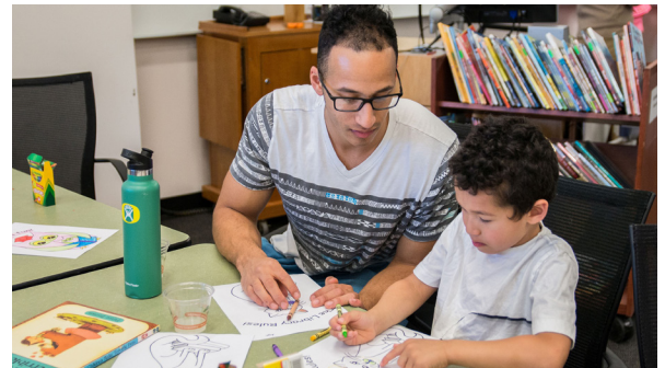
Kids and their parents enjoyed new boxes of crayons and the coloring pages we made just for this event.