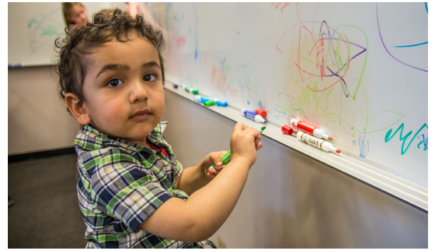
The whiteboards in the library classroom were very popular, especially with our littlest visitors.