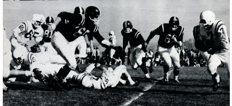
Viking football fans and team Viking 1964