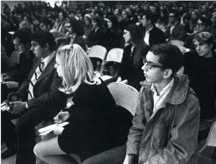
Students attend a lecture Viking 1972