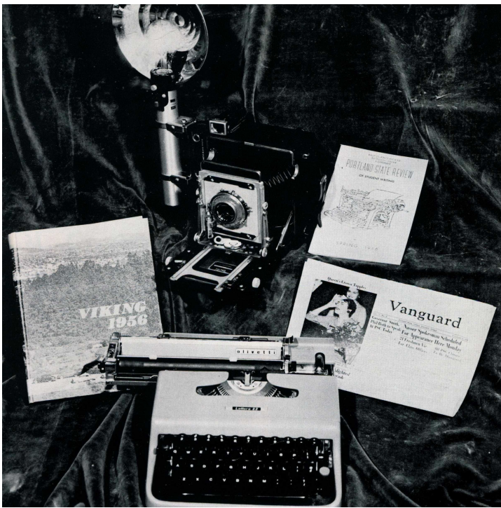
Campus publications Viking 1958

Portland State University celebrates its 70th anniversary in 2016. To honor this historic milestone, PSU Library's University Archives have made the complete collection of the Viking yearbooks available online. Students, alumni and the PSU community can experience Portland State history through the Viking.