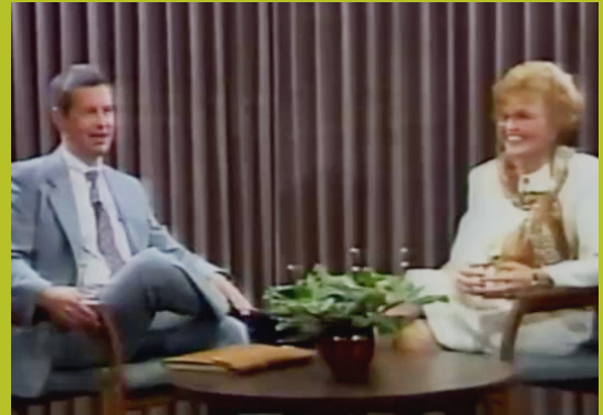
Ask the Governor, 1991

Throughout her public appearances, Roberts responded to questions, listened to ideas from all, and spoke directly about the challenges which all Oregonians faced. Her open dialog and her faith in her constituents was exemplary and remains at the heart of her legacy.