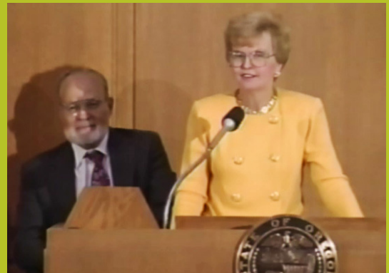
State of the State Address, 1993