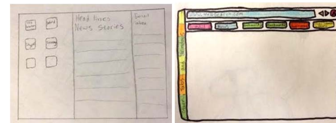
Figure 3: Desktop and browser

For the desktop we eliminated the "toolbar" that is normally seen at the bottom or on the side of a desktop screen. Instead we are organizing each component in a box - internet browser, direct link to news, etc. in one section - and we have an open "window" directly on the desktop for other things like E-mail inbox, grocery list, and a local map.