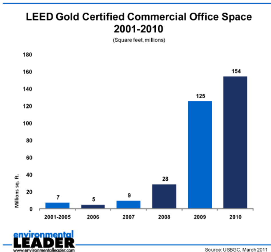
Figure 2 LEED Gold Certified Commercial Office Space 2001-2010

The number of certified LEED buildings continues to increase exponentially. The figure below shows the growth of the amount of square feet in millions per year of LEED gold certified commercial office space between 2001 and 2010. As of May 2013 (as provided by USGBC), there are currently 44,270 LEED projects in the United States.