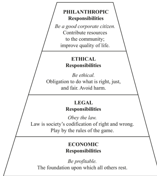
Figure 1 – Carroll's Pyramid of Corporate Social Responsibility