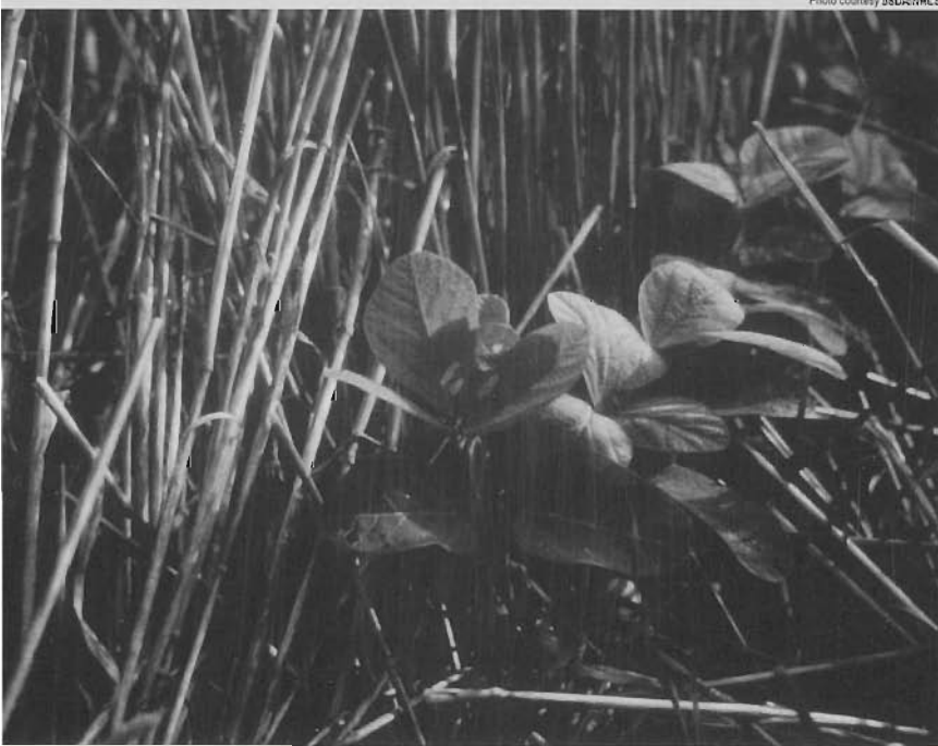
Conservation tillage can promote both greater profitability and higher stream quality, but is not an appropriate technology choice in all agroenvironmental settings. In the search for "complimentary technologies," there are likely to be no silver bullets.

Private stewardship works when market incentives encourage practices that also improve envi-