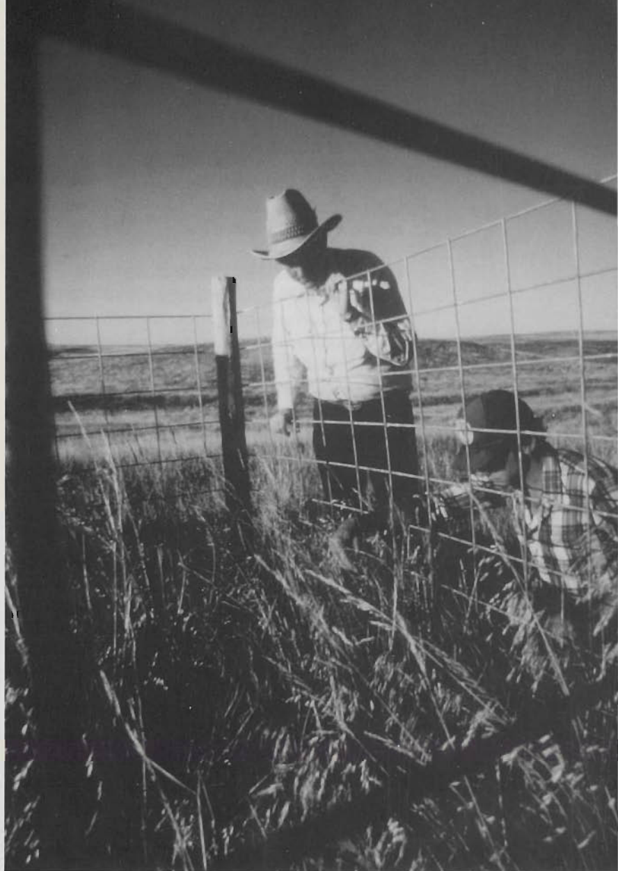
Rotational grazing, as an alternative to confined livestock operations, depends on new kinds of management strategies. Here, farmers fix a paddock fence used to move animals around the pasture.

Regardless of the availability of trained staff, the current technology path will likely fall far short of its environmental potential. The research, development, and implementation process is being driven largely by economic forces without companion environmental objectives and incentives. Agriculture is generally not subject to comprehensive environmental performance standards, such as air and water quality emission levels for other industries. For example, guidelines for crop residue to reduce erosion apply under conservation compliance, but only for agricultural program participants and only until the programs expire. Waters returning to streams and rivers from irrigation ditches are often not sub-