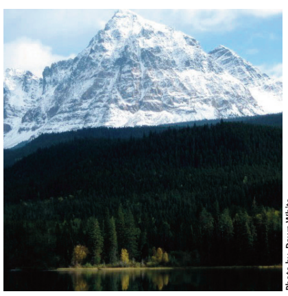
Mt. Fitzwilliam and Yellowhead Lake, taken as Via's train, the Canadian , went through Yellowhead Pass.

and a few settlements. But eventually the Shield gave way to the farms in settled Ontario, with maples and birches providing the color. It was about noon Thanksgiving Saturday when we arrived just a few minutes late in