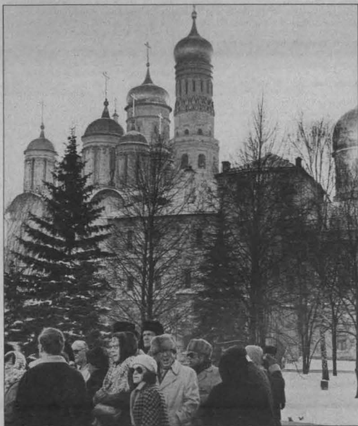
Alumni from Portland State University and the University of Oregon visited Leningrad and Moscow in December. Highlights of the nine-day trip included a tour of the Kremlin (pictured). Another tour will run in March.