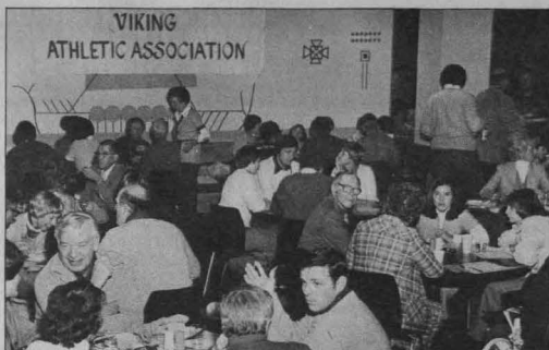
Portland State University alumni enjoyed a steak dinner in the Nordic Land Room on campus before being bussed to the PSU-Montana State game at the Civic Stadium. The event was co-sponsored by the Viking Athletic Association and the Alumni Office.