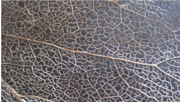
Figure 4: Interconnectedness

Engagement with living soil in school learning gardens is one practical way to introduce students to the idea of interconnectedness.