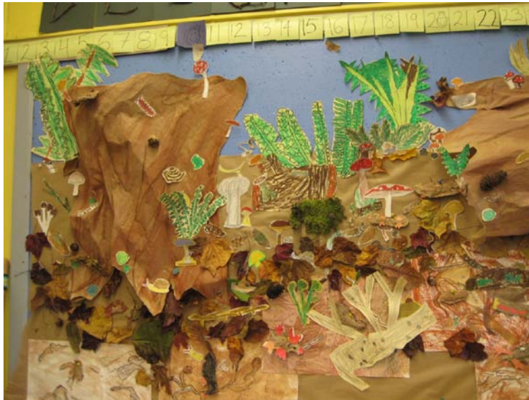
Figure 2: Student mural of soil life

Soil is more than a mere growing medium. It is a unique confluence that includes eroding rock, decomposing biomass, microorganisms, animals, insects, water, and air. It is layered, develops over time, is fragile yet resilient, and contains and supports life.