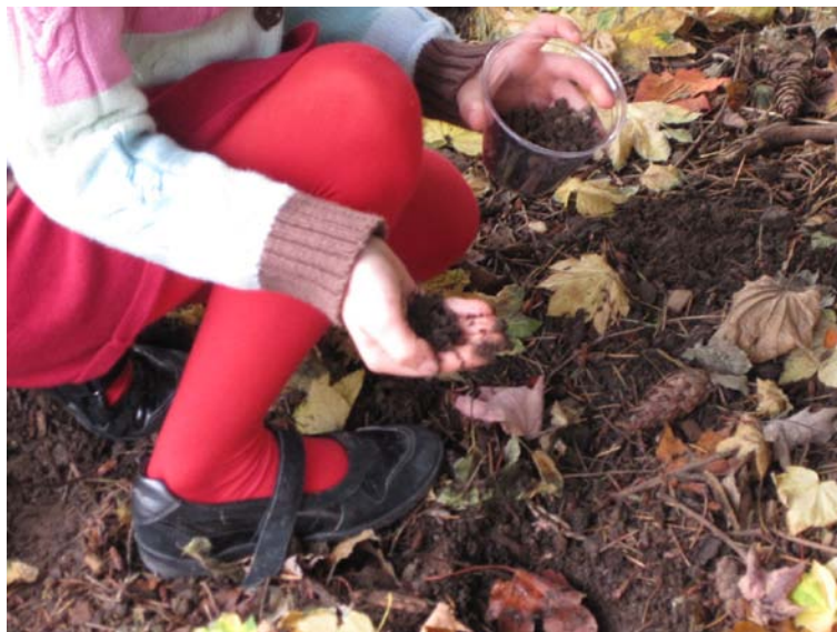
Figure 1: Handful of living soil

Given the burgeoning urban population worldwide, soil is often out of sight out of mind. Children, particularly urban children, grow up more with a sense of grey roads paved with asphalt and concrete than with “dirt” roads of exposed soil (Louv, 2008). Tar, rather than soil, is the smell they are more likely to decipher. Paved realities of sealed and impervious soil will likely alter the human experience and psyche in deep ways. This is particularly disturbing, since soil pulsates with life; it is the living skin of the earth (Logan, 1996). Unlocking the mysteries of soil helps us to unlock the secrets of sustainable life. Instead of looking for life upward among the celestial stars, we suggest paying attention downward to life beneath our feet.