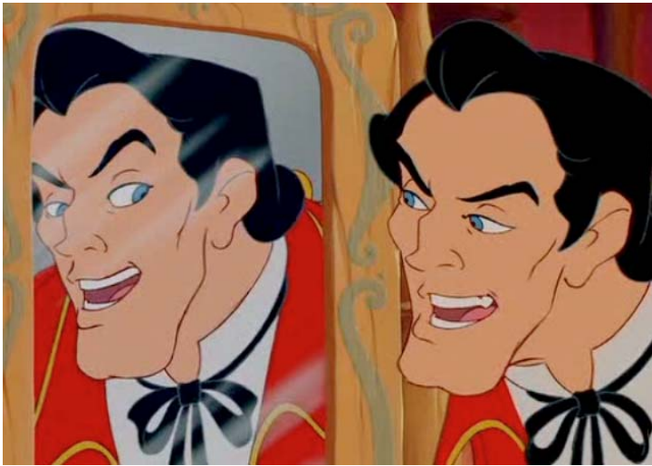
Figure 1. Gaston ( Beauty and the Beast ).

admirably masculine Belle reconfigures into wife and domesticator. We have forgotten her desire to be out in the world; she truly wanted to be in the alternate world of the castle, one in which the crowd's surveillance raises her to a position of value rather than the provincial town in which she was configured into the deviant. Juxtaposing these two observational regimes, the fundamental instability of values placed on femininities within the structures of new heterosexism becomes apparent, as will be explored later.