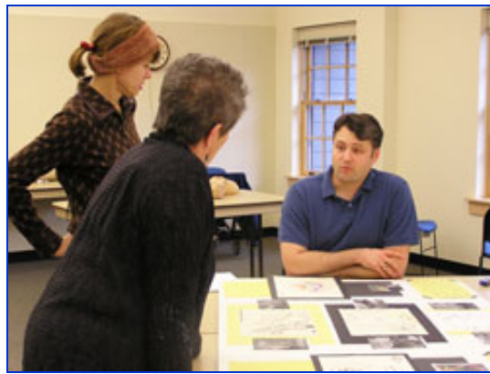
Figure 3. Discussing the focus of documentation panels.

Sheryl then posed a question that moved us to consider identifying a theme in the content of the panels (Figure 3).