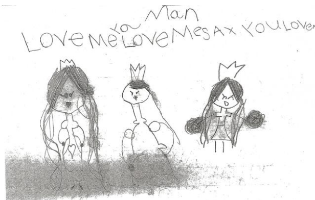
Figure 3. Princesses, cheerleading, and Justin Bieber

Example 3: Describing activities they like. This student writes the chorus from the Justin Bieber song Love Me. She writes, “Ya Man, LOVeMeLOVeMeSAY YouLOVeM” Translation: “Ya man. Love me, love me, say you love me.”