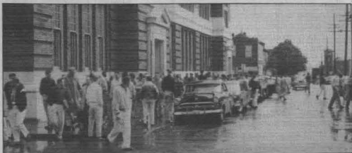
Old Main is now Lincoln Hall