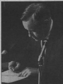
Tom McCall signs bill making Portland State College into Portland State University.

During the next four years, interim campus locations followed, with the school finally locating in an old high school building in downtown Portland (that building, Lincoln Hall, still is in use).