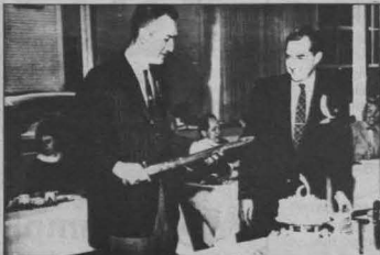
PSU's 6-year anniversary