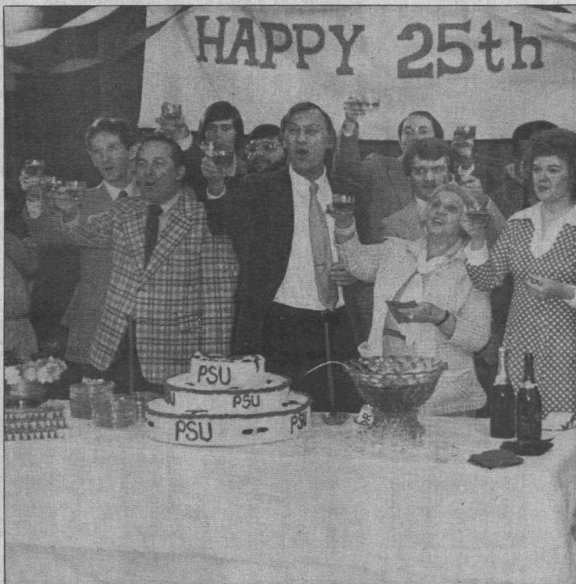
"Happy Anniversary, Portland State!" A group of alumni and students toast the University's 25th anniversary during filming of a television public service announcement to be broadcast on Portland television stations. See story on page 1.