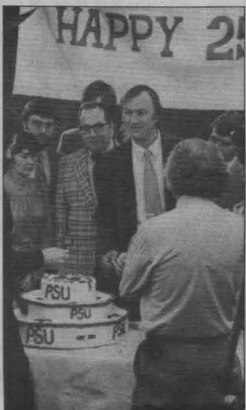
PSU's 25th anniversary

Soon the complexion of the institution began to change. Enrollment in academic subjects increased, bringing pressure for departmental majors in the humanities and sciences. Originally, Portland State College was to offer only teacher training and general studies programs along with lower division courses to prepare students to enter the state's older, established institutions. However, community, faculty and student pressure was again successful in expanding Portland State's educational horizon, this time with the establishment of nine department baccalaureate degrees in 1959. Graduate degree programs eventually followed the expanding curriculum