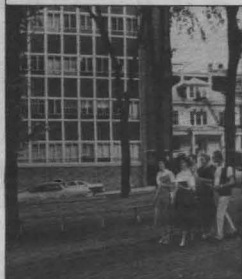
1956 in the Park Blocks

In its first 25 years, PSU has evolved into a vigorous urban university offering year-around study, both day and night, with an enrollment which topped 17,000 in the fall of 1979.