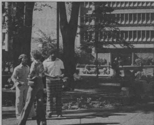
1979 in the Park Blocks

with the first graduate program, the School of Social Work, beginning in 1962. Next came masters programs in teaching in 1963.