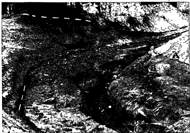
Fig. 2. West Pine Creek showing three overlapping mudflow deposits. a = outer flow; b = middle flow; c = inner flow, which has already been partially eroded. Two months after this picture was taken, the inner flow deposit was completely eroded and the middle deposit was partially buried by later mudflows.

The first procedure used unusually large blocks as indicators of the yield strength of the flow. The densities of both the supported block and the matrix of the flow were measured and the blocks partially excavated to calculate the ratio of their submerged to total height. We then used the formula (Johnson, 1970, p. 486):