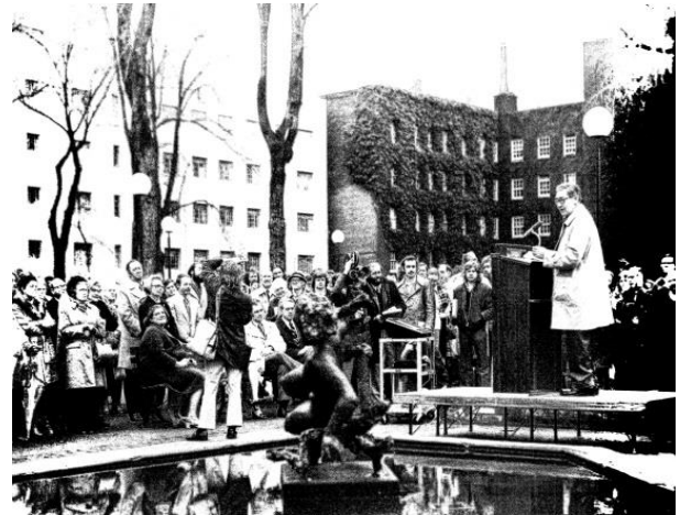
Dedication of Farewell to Orpheus in 1972