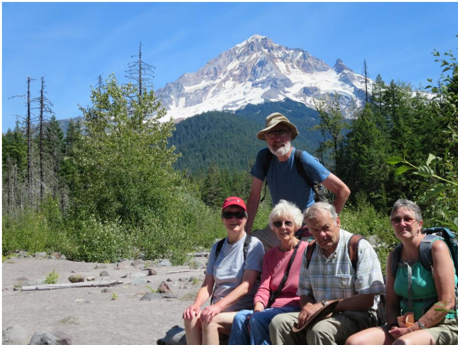
RAPS Hikers on Ramona Falls Trail