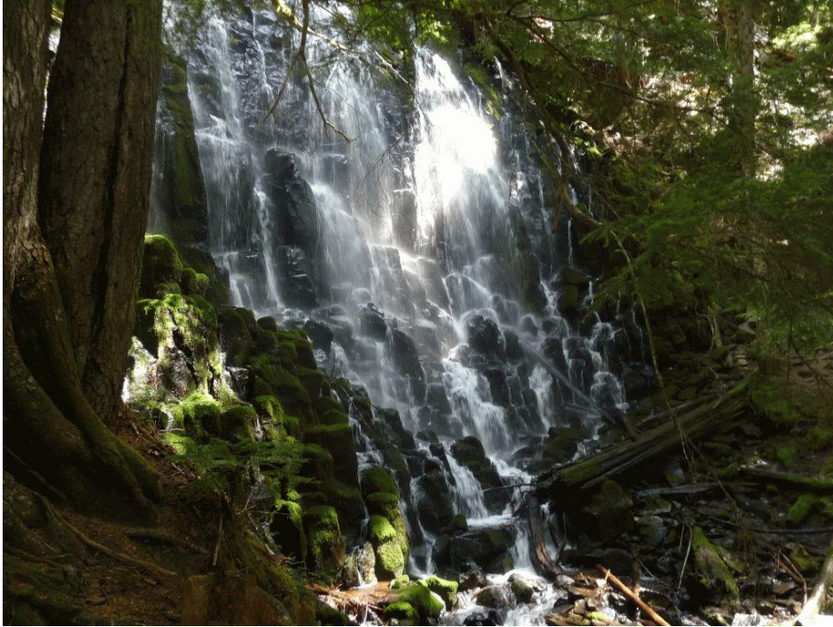
Ramona Falls