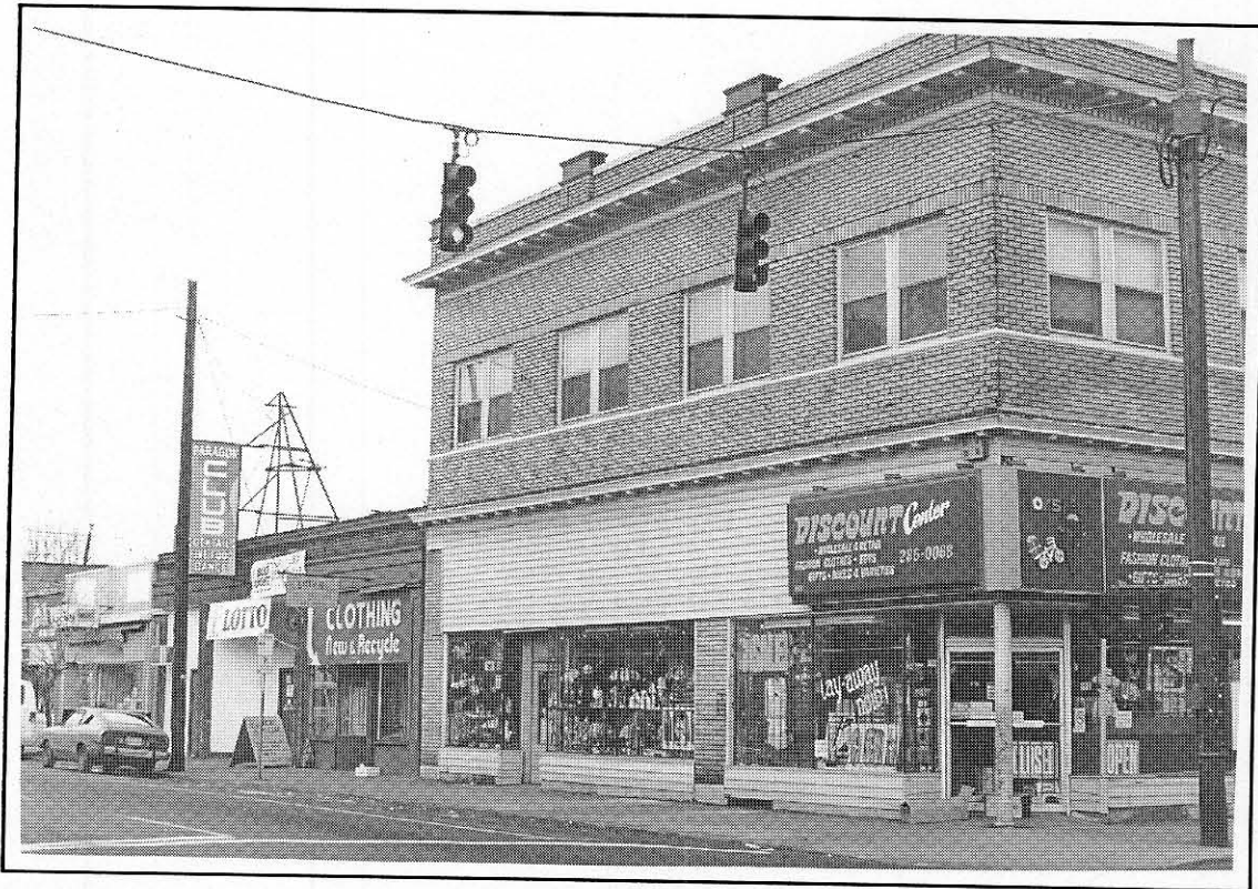
New retail businesses and restaurants are springing up along Killingsworth Avenue.