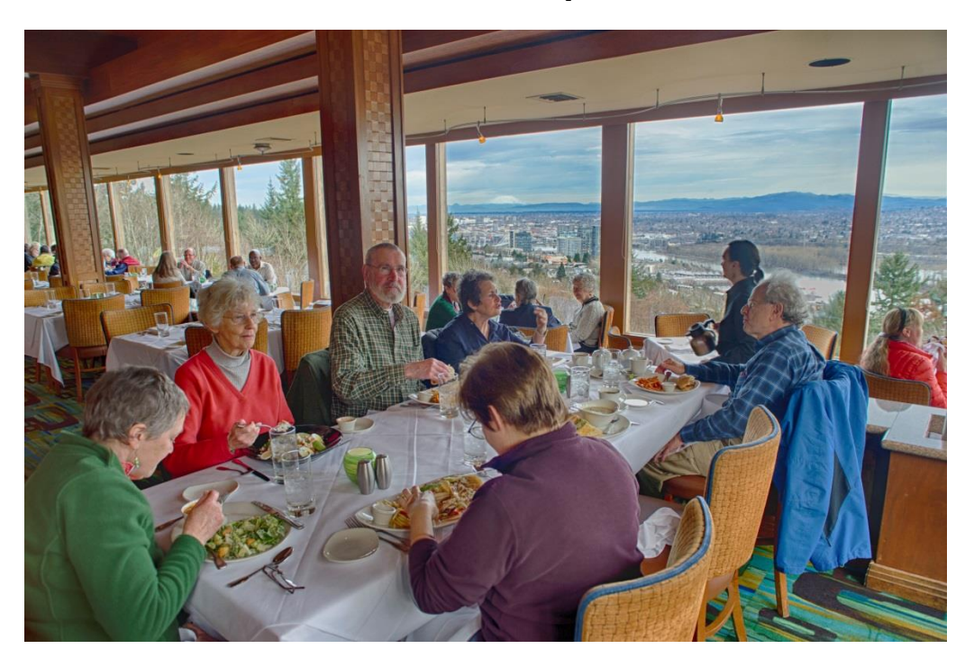
The Hiking Group at Lunch