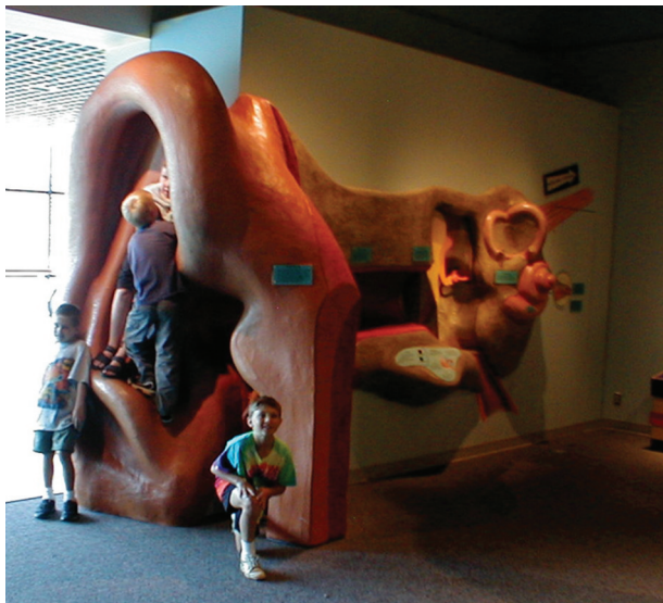
Figure 1. Future hearing scientists explore the Giant Ear at the Oregon Museum of Science and Industry Dangerous Decibels exhibition. The 12 components of the exhibit cover 2000 square feet and include family-friendly activities for all ages. It is the only exhibition in the world dedicated to the prevention of noise-induced hearing loss and tinnitus.

titudes and intended behaviors in young people. The Virtual Exhibit was made available to the public in May of 2005. It is a resource that is used in NIOSH young worker safety training and U.S. Army educational programs for new recruits.