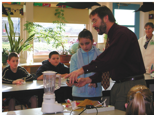
Figure 2. The Dangerous Decibels classroom outreach program uses “inquiry-based learning” methods to engage kindergarten through high-school students. Here a student is learning to measure sound levels and the principle of sound pressure diminishing with distance from the source. The science-rich, age-appropriate curriculum includes the physics of sound, normal function and pathophysiology of hearing, consequences of hearing loss and methods of hearing loss prevention. The program was developed by collaborations between hearing scientists, educators and health communications experts.

This exhibit is a massive, cochlea-shaped chamber housing an educational, interactive computer game that entertains while automatically screening hearing thresholds at 4,000 Hz – the frequency most vulnerable to noise-induced cochlear damage (Figure 3, 4). While visitors are playing, it also acquires demographic information and a history of recent noise exposures. Visitors are given the results of their hearing screening and information about their personal risk factors for exposure to hazardous noise. Over 36,000 visitors to Listen Up! have elected to include their test results in an OHRC study of automated hearing health data acquisi-