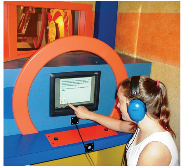
Figure 4. Visitors are given the opportunity to participate in ongoing research on the relationship between noise exposures and the presence of tinnitus and hearing loss in the population. Data are continually transferred from the museum to the Oregon Hearing Research Center for analysis. In addition, a subset of the data can be viewed online at the Dangerous Decibels website ( www.dangerousdecibels.org ) in the Information Center, Exhibit Research section. To date, results from over 36,000 subjects, from the ages of 6 to 85 years, can be accessed for study by the public.

pated in a summative evaluation of the OMSI museum exhibit. Participants were asked to fill out a baseline questionnaire that addressed their knowledge, attitude and behavior regarding hearing and hearing loss prevention. Following their experience with the Dangerous Decibels exhibit, they were asked to fill out a second questionnaire with similar questionnaire items. The majority of adults (90%) were able to correctly identify dangerous sources of sound prior to experiencing the museum exhibit. However, when asked about their use of hearing protection, only 8% indicated consistent use of hearing protection when around loud sound. Questionnaire items related to the consequences of noise exposure and strategies for prevention of hearing loss showed fewer correct responses at baseline (10% - 22% correct responses) and demonstrated significant increases in correct responses following the museum visit, ranging from 10% - 56%. To evaluate the impact of the museum exhibit on future behavior, participants were asked whether they would wear hearing protection if they went to a loud concert. Only 30% of the participants said they would wear hearing protection prior to their visit. Whereas, following the visit, 62% of the participants stated that they would wear protection,