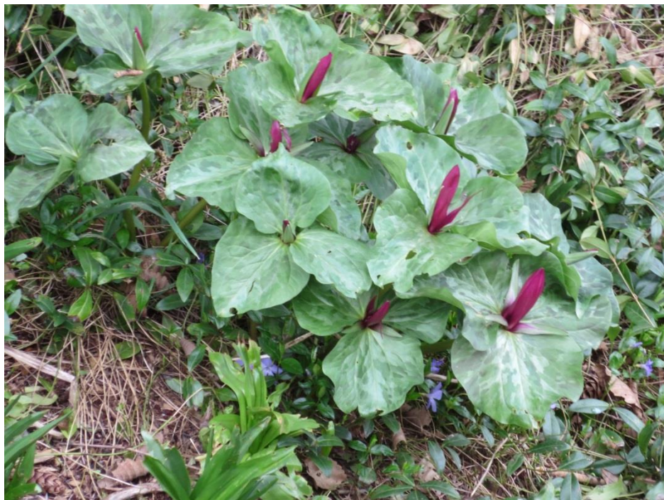
White and Red Trilliums – Sure Signs of Spring