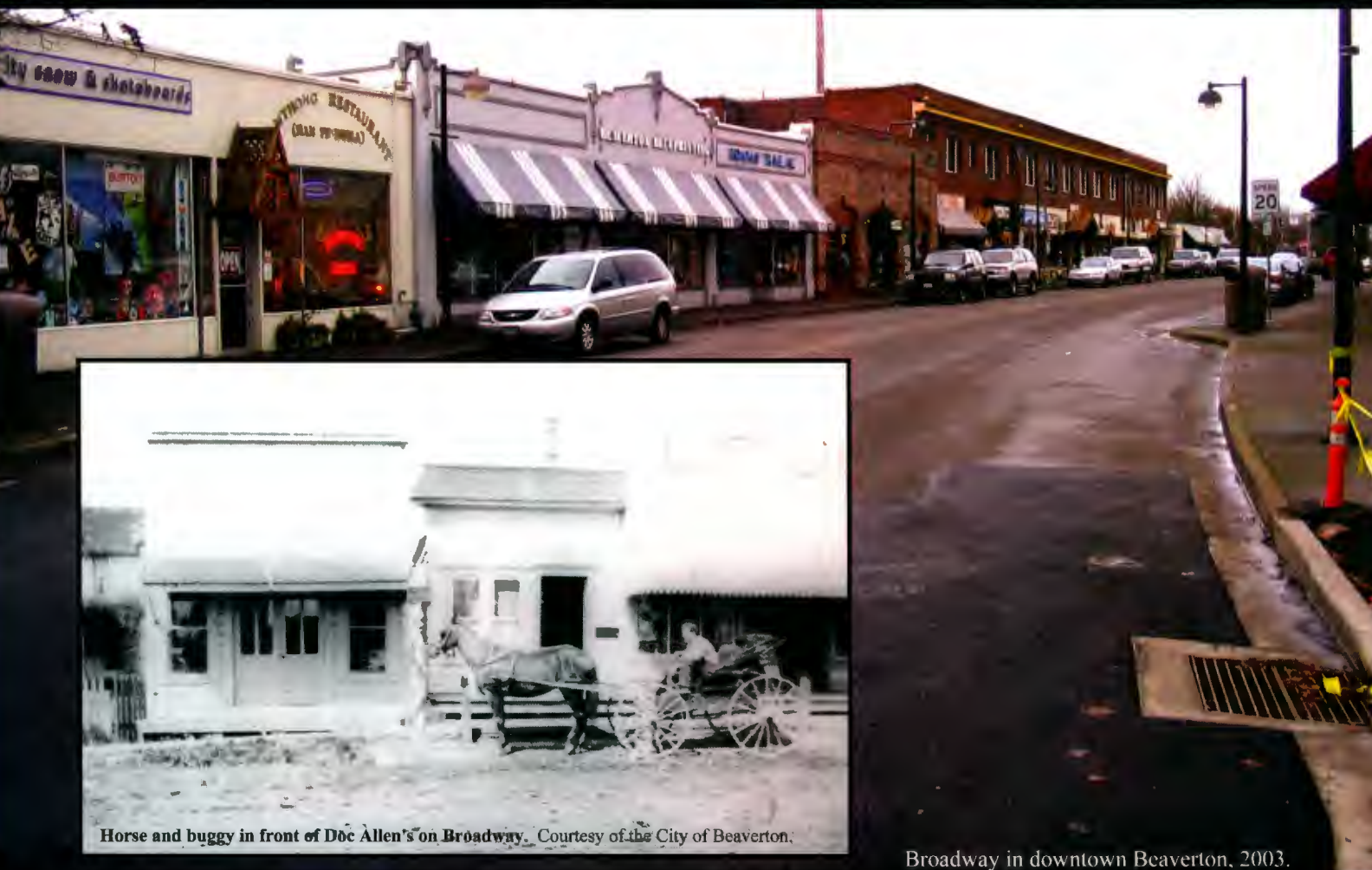
Horse and buggy in front of Doc Allen's on Broadway.