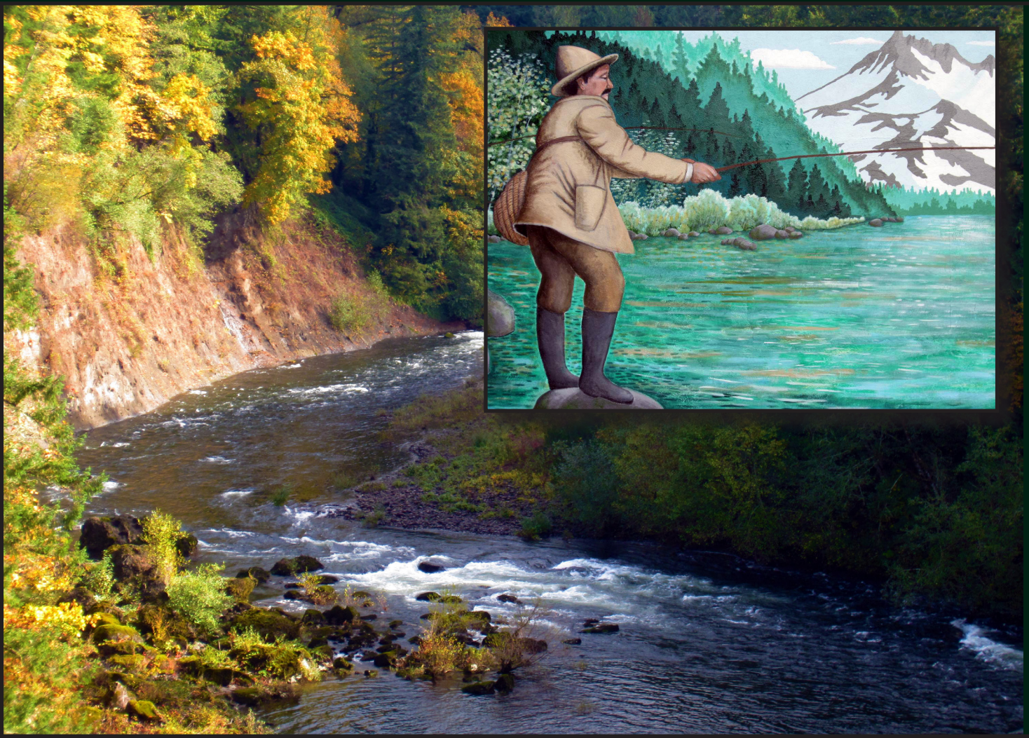
Estacada Census Profile 2000 and 2010