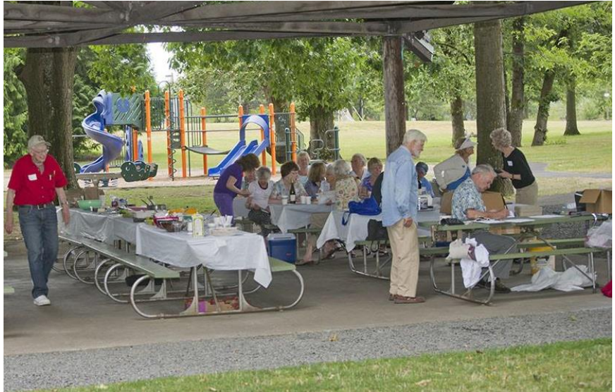
The RAPS Summer Picnic returns to Willamette Park