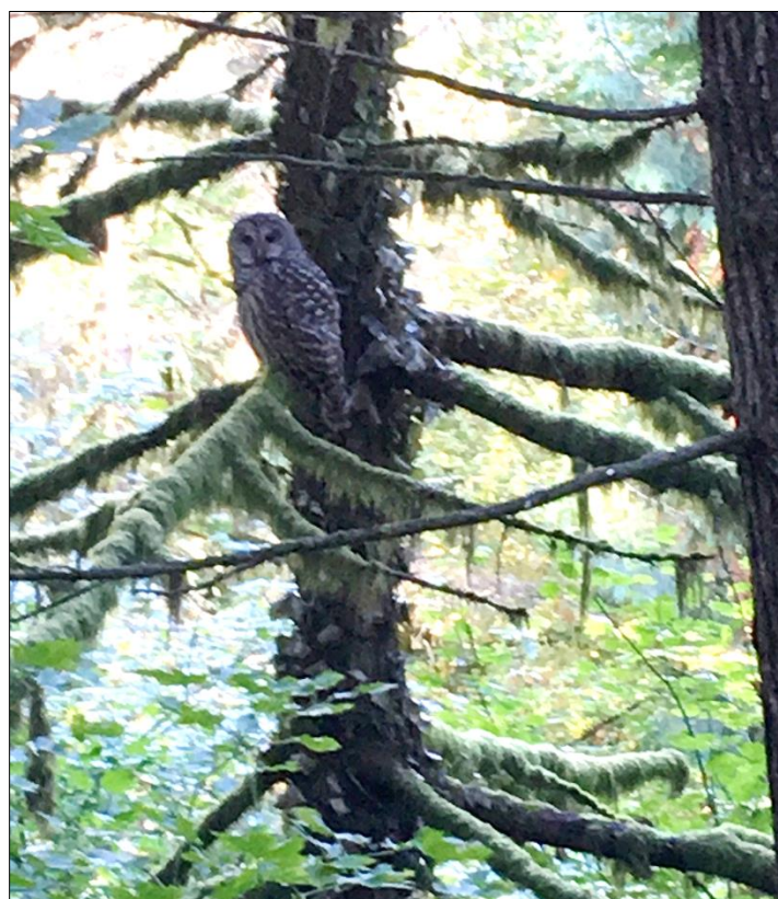
Barred Owl