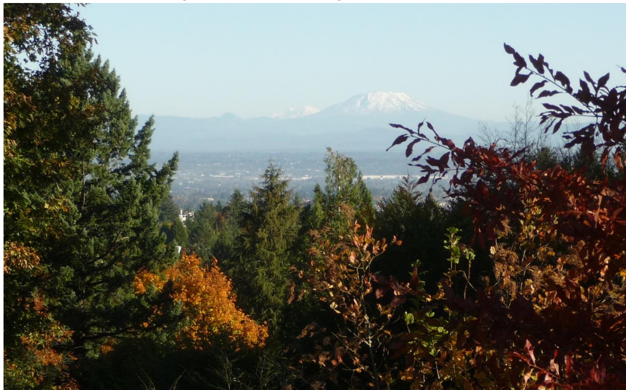
Mountain view from Hoyt Arboretum