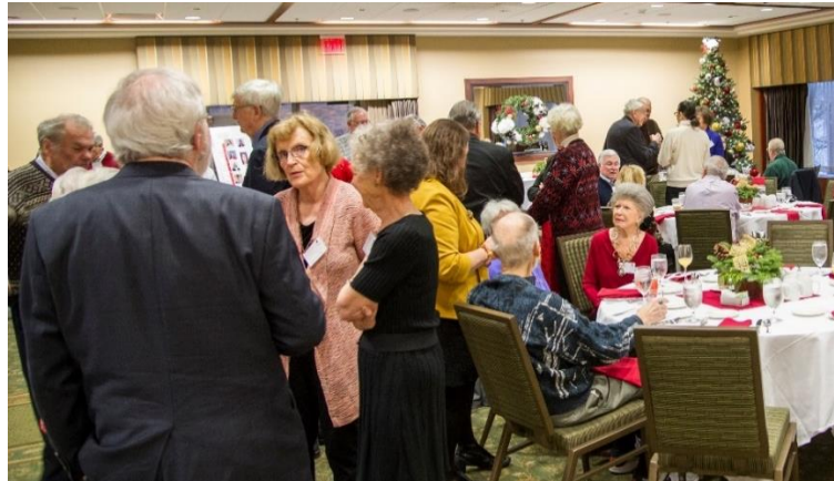
December 2016 Holiday Brunch