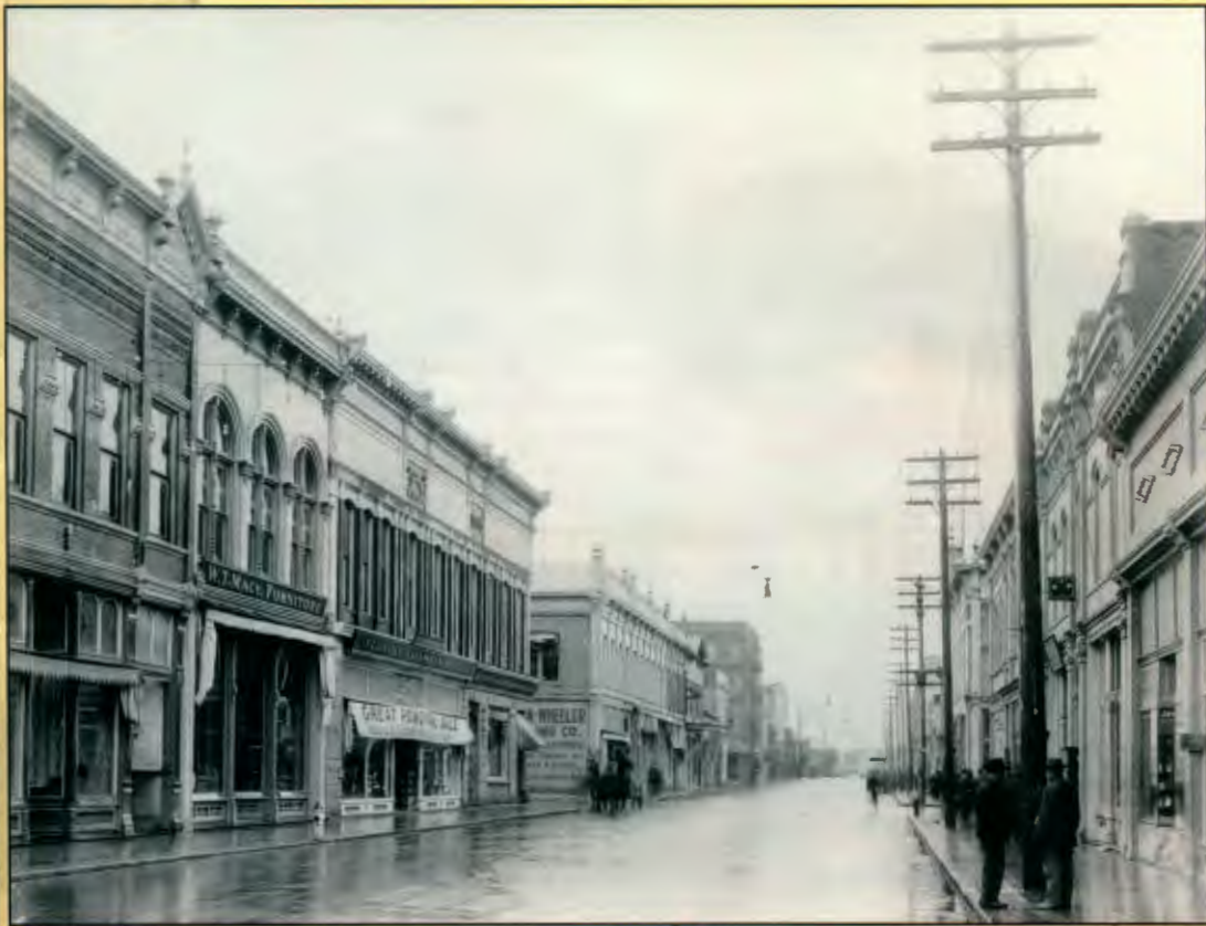
Downtown McMinnville business district in 1920.