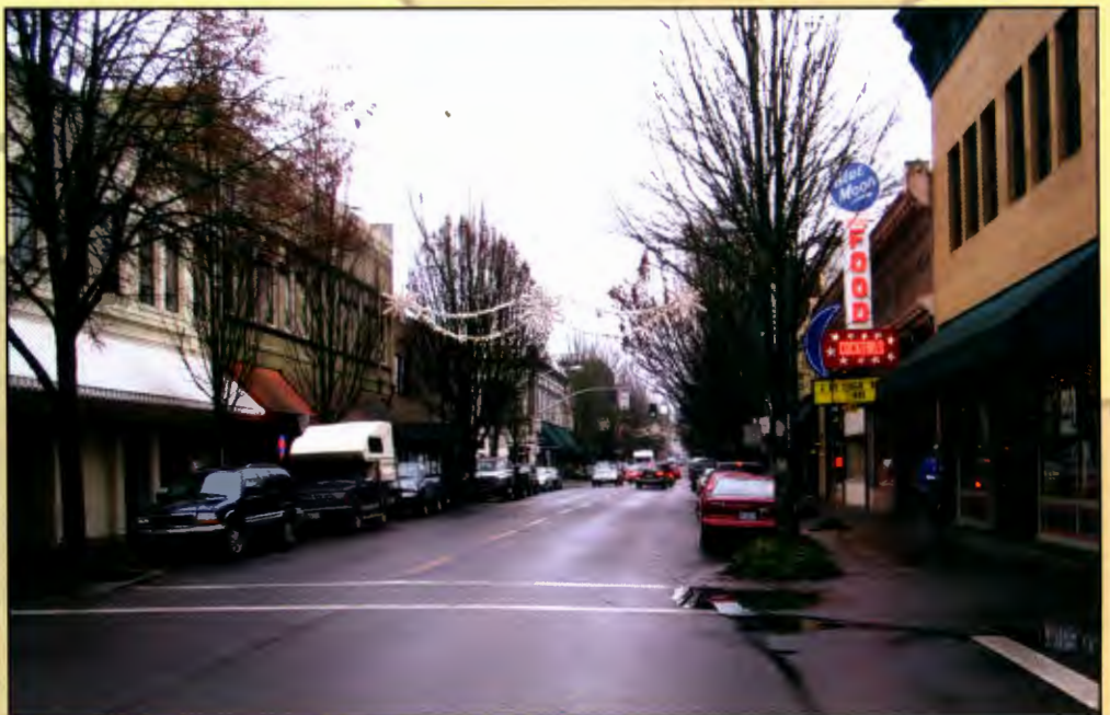
Downtown McMinnville business district in 2004.