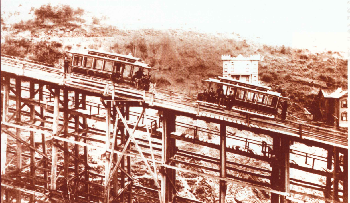
The Council Crest streetcar in 1891.

The love affair with rail in the Willamette Valley began long before the area became known for its light rail system or its more recent streetcar line in downtown. The history and landscape patterns of the metropolitan area are intertwined with the rail network that was established early throughout the valley. Portland was established in 1853, and only two decades later, in 1871, a horsecar line was granted a franchise to run along First Street. By the 1880s, lines were installed through the downtown area, presumably to allow coaches to travel more easily through the heavily muddied river bank streets of the young city. Before long, these privately funded endeavors had blanketed the west side of