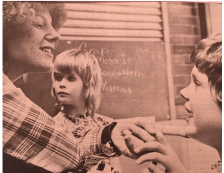
—Photograph taken at Helen Gordon Child Development Center and used with permission of author.

PAST TENSE is an occasional column featuring glimpses into Portland State's history. To submit a story (or an idea for one), email the RAPS History Preservation Committee