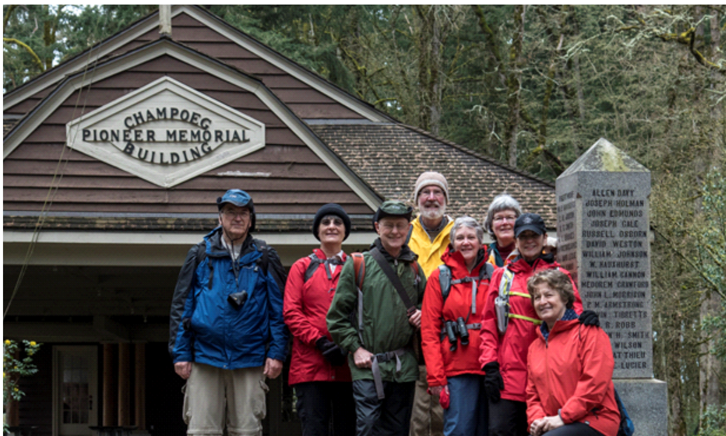
Hiking group members tour pioneer settlement sites and revisit Oregon heritage on March 27.