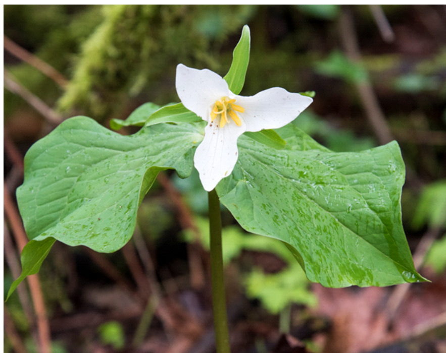
Early trillium blossom on Champoege Park trail.