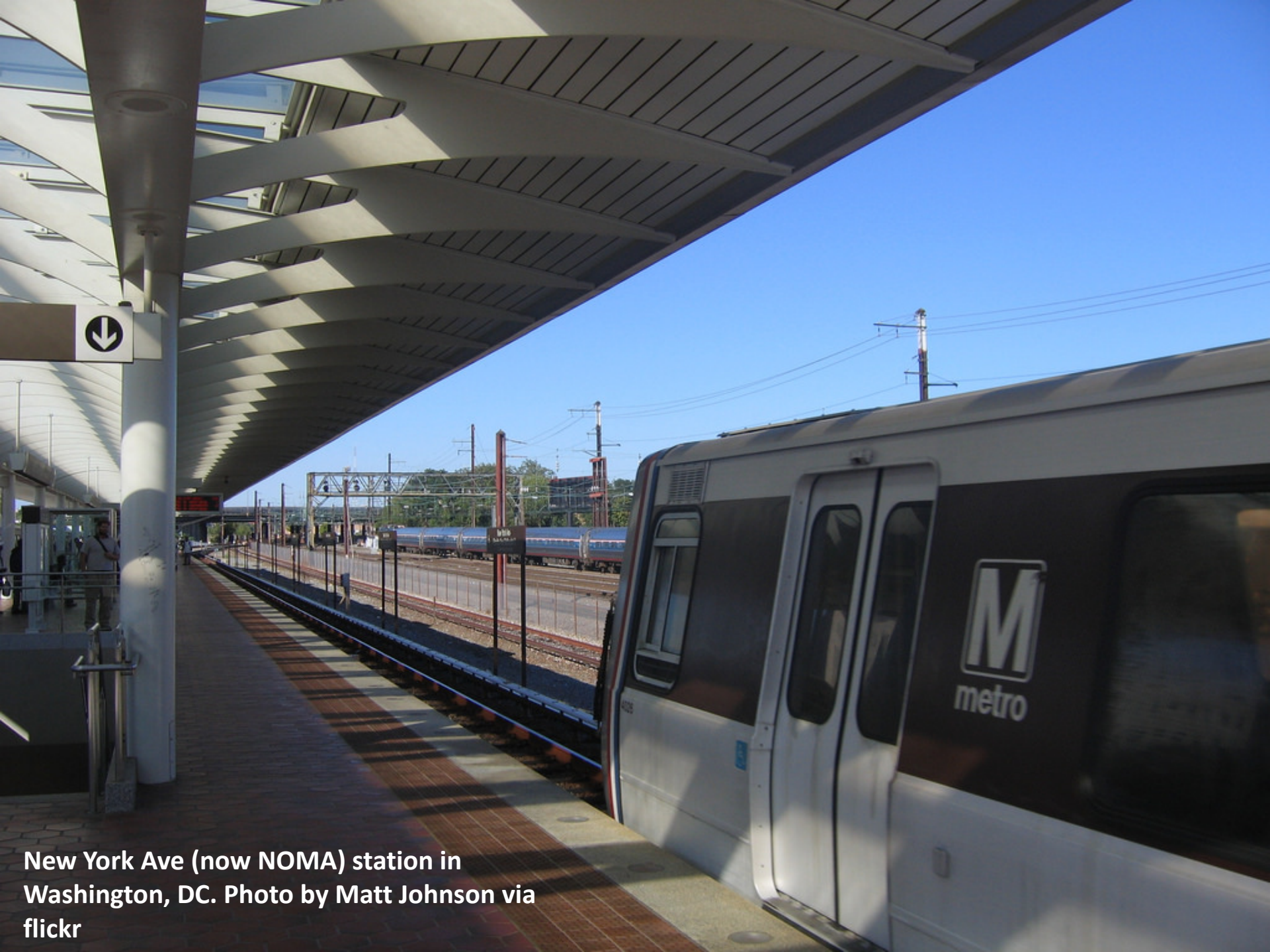
New York Ave (now NOMA) station in Washington, DC.