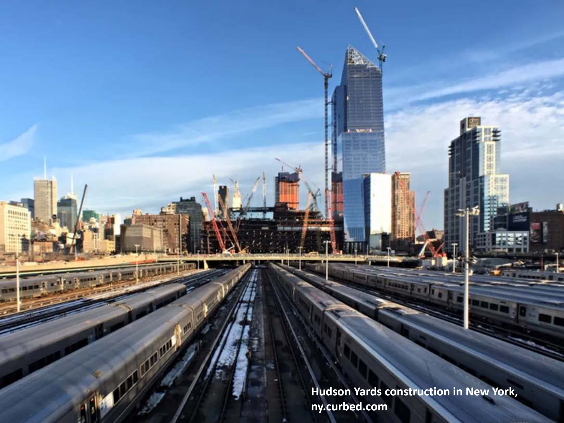
Hudson Yards construction in New York, ny.curbed.com