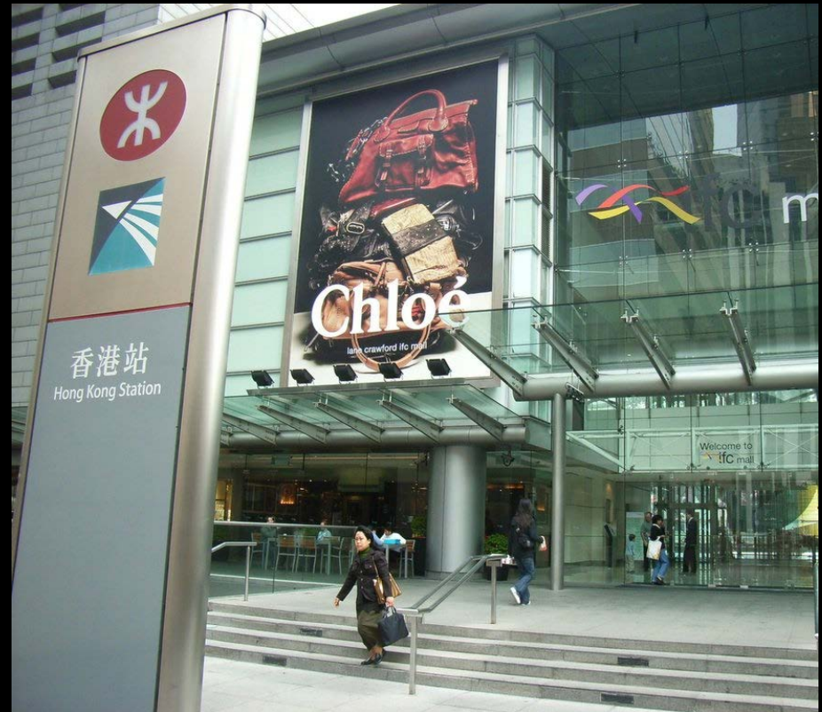
Hong Kong's International Finance Center mall and cinema with an MTR station integrated into the building