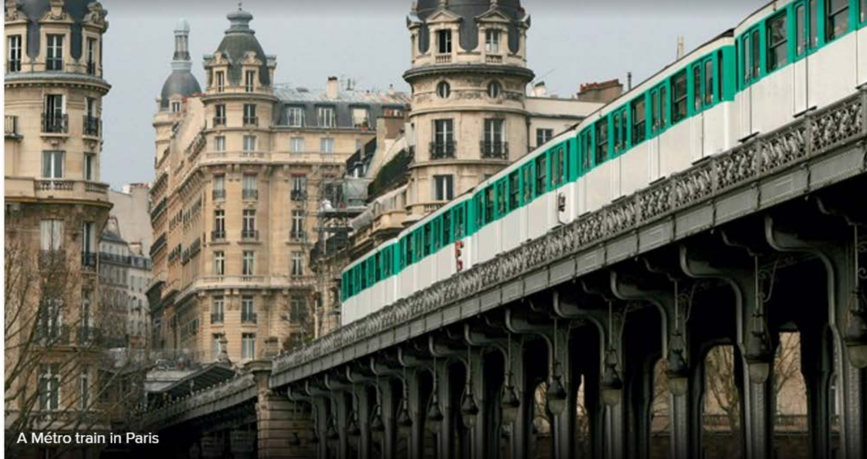
A Métro train in Paris