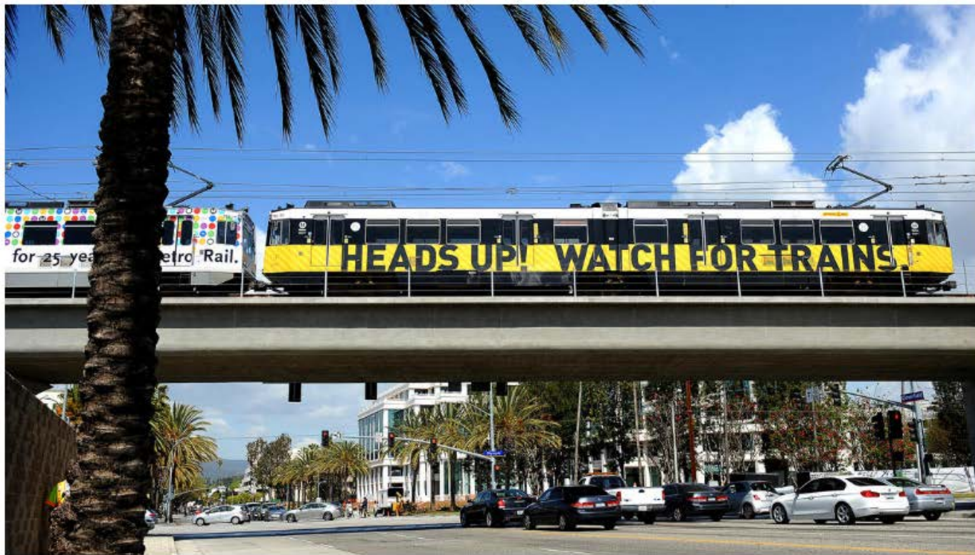
A train rides over a bridge to the 26th Street/Bergamot station in Santa Monica.