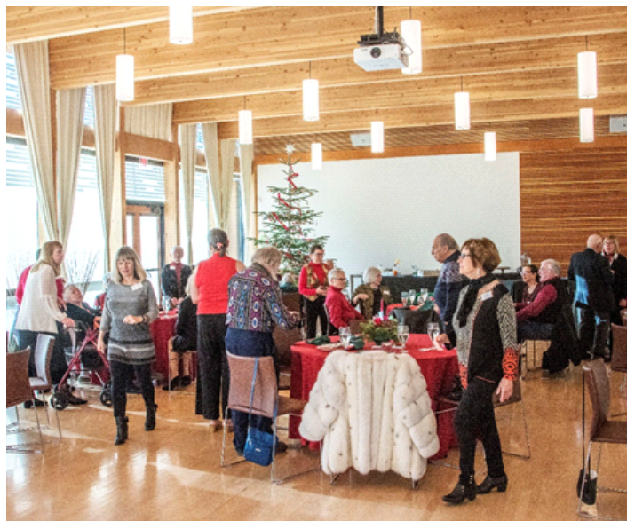
RAPS members enjoy the annual Holiday Brunch at Nordia House on a sunny December day.