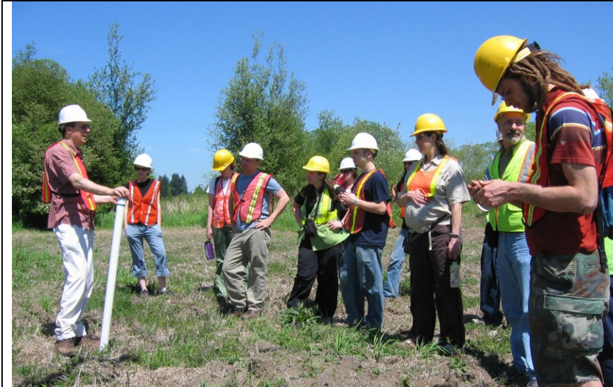
Road Ecology students on the Boeckman Road field trip, 2007.