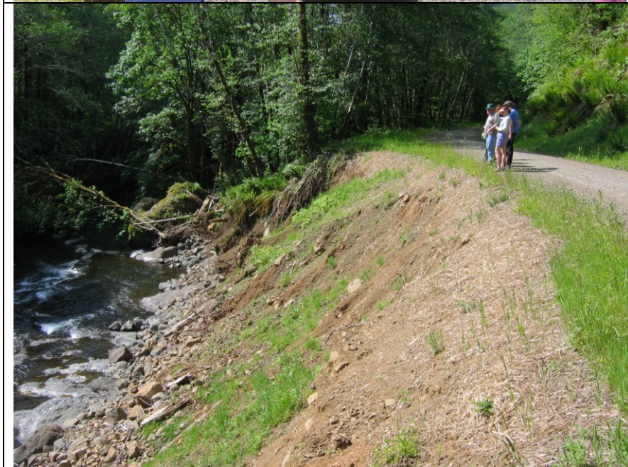
Students observing landslide impacts on streams caused by road construction.