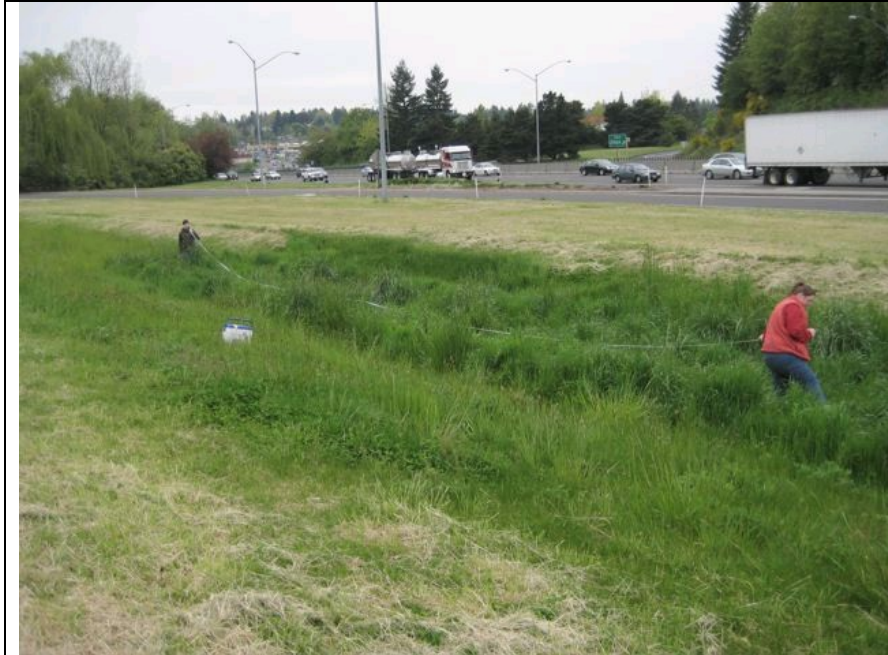
Road Ecology students measuring swale contamination for their group project with ODOT.