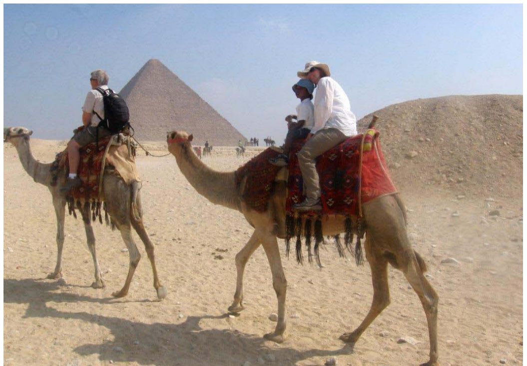
Author and her family at the Great Pyramids.

Otherwise, though, life in Cairo was good. We felt very safe, even at night. We joined an American expat club with a pool, restaurant, and tennis courts, which felt especially luxuri-