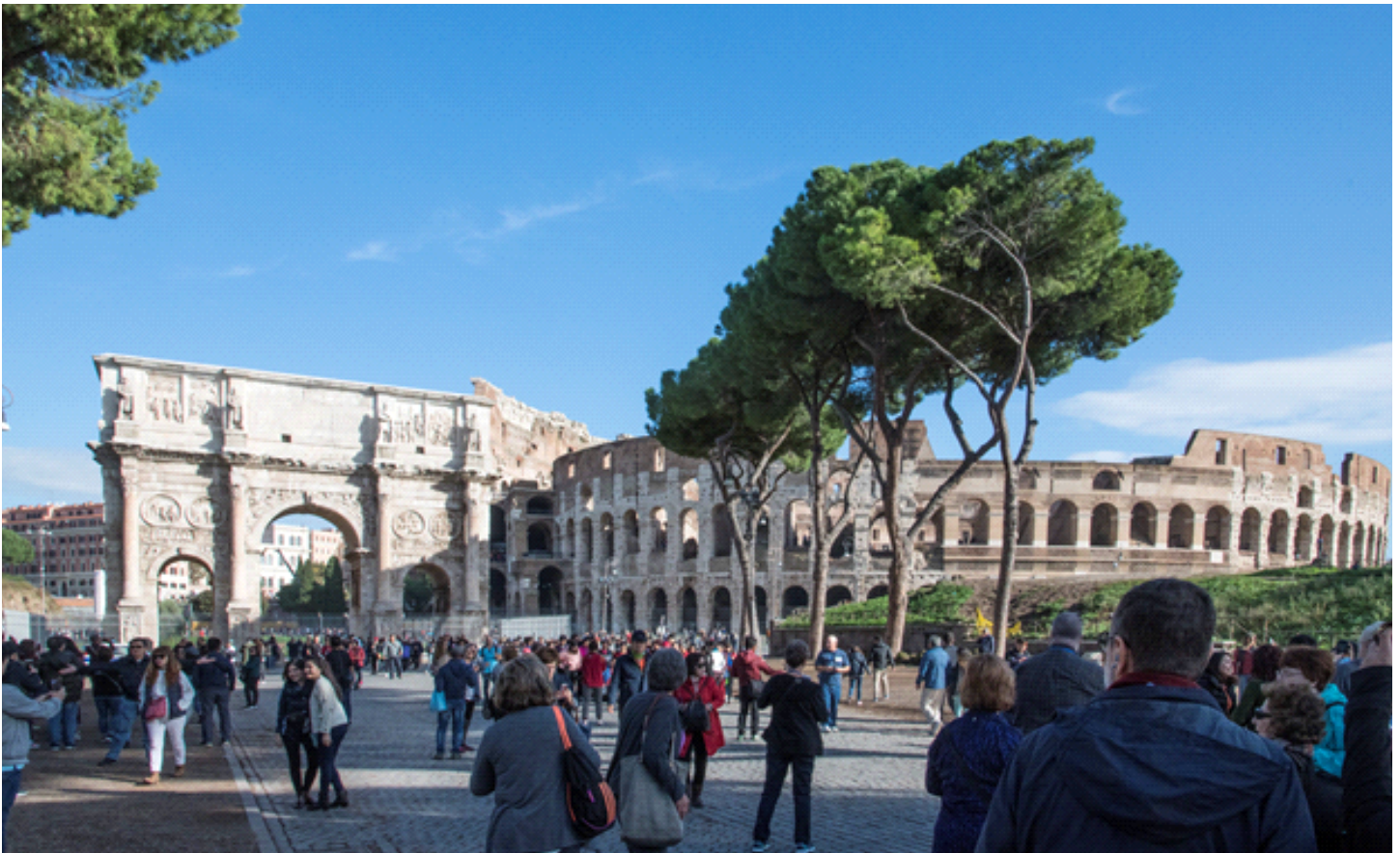
RAPS members explored the Colosseum in Rome as part of their 13-day tour of Italy with Collette Travel last November. The tour also included stops in Italian cities Pompeii, Capri, Tuscany, Florence, Venice, as well as Locarno, Switzerland.