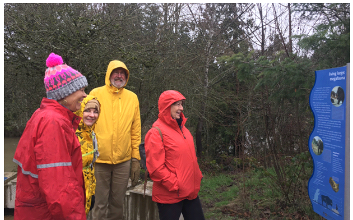
RAPS Hiking Group members discussed the Ice Age trail markers along the Tualatin River Greenway while on the February hike.