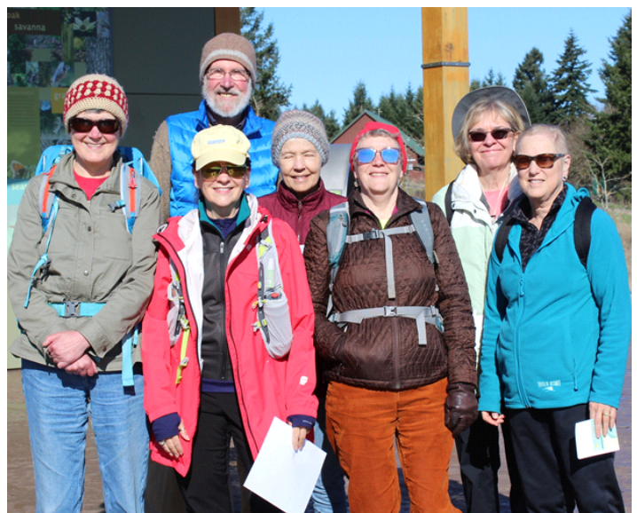
RAPS hikers enjoyed classic vistas, fragrant forests, and dry, sunny weather on the March 26 hike on Powell Butte.