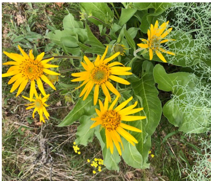
Hikers exploring Catherine Creek in April found an abundance of wildflowers along the trails.