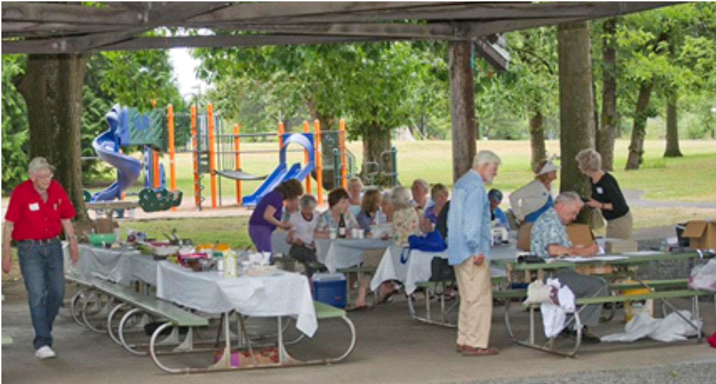
The RAPS Summer Picnic will be held at Willamette Park on Thursday, August 15.

THE 2019 RAPS SUMMER PICNIC will be held at Willamette Park Shelter A from noon to 4:00 pm on Thursday, August 15.